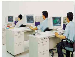
設計研發部 Design Department