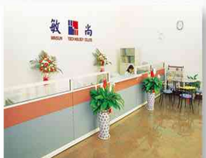
接待中心 Reception Center