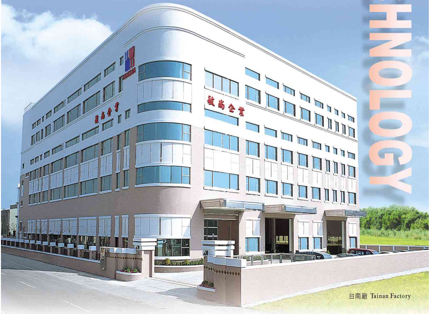
台南廠 Tainan Factory