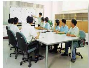
技術研討會議 Technical Conference